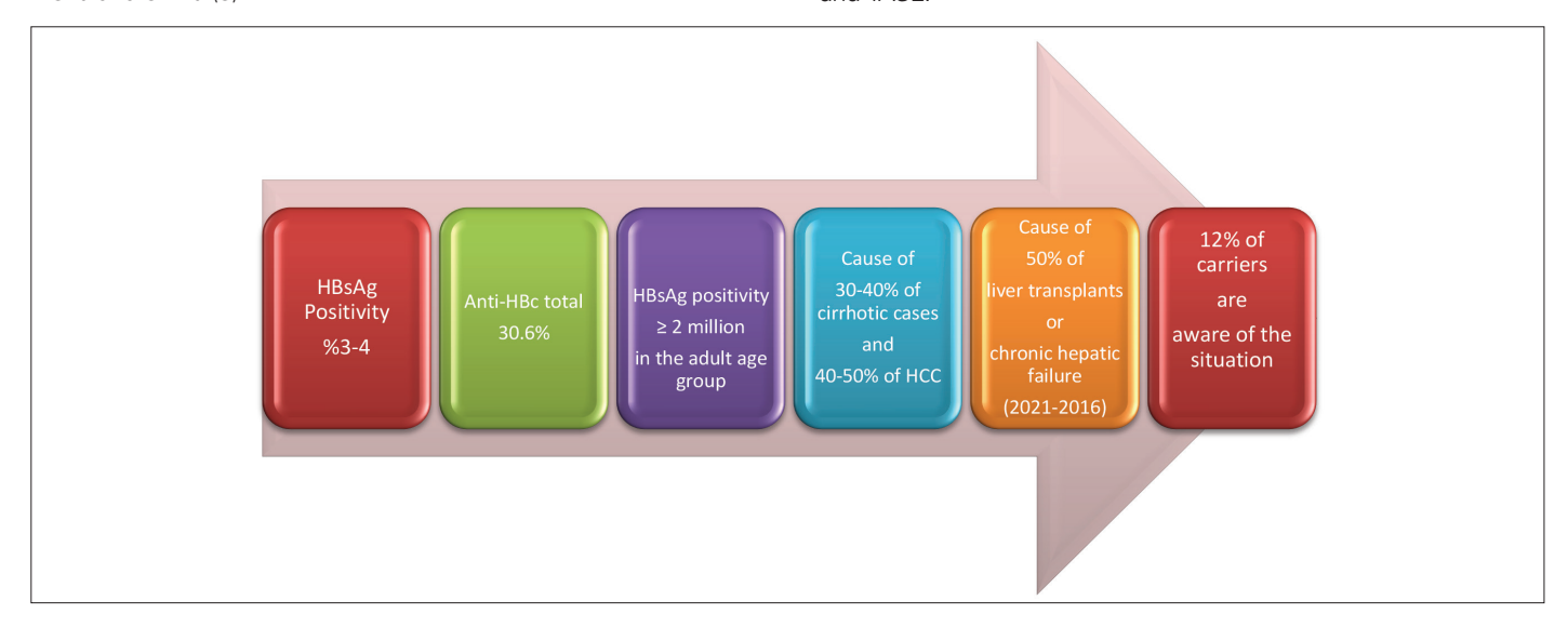
Figure 1. Epidemiologic features of hepatitis B virus infection in Turkey

Apart from the comprehensive "Turkish Viral Hepatitis Prevention and Control Program" managed by Ministry of Health, two road map projects were carried out to facilitate the national program and determine achievable, smart targets. The first of which was to target the elimination of hepatitis C virus (HCV) in June 2018 with the cooperation of Viral Hepatitis Society (VHSD) and Turkish Association for the Study of the Liver (TASL), "Hepatitis C Elimination Roadmap Recommendations and Workshop in Turkey" (14) was created. Then, in 2020, the "National Hepatitis B Elimination Roadmap" (15) was created in cooperation with VHSD and TASL.