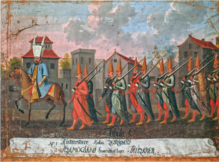
Fig. 2. Azamoglans with guns in Sultan Mehmed IV's entourage. Painting of Claes Râmb (1657)

book indicates there were over 600 armorers active in the campaigning year of 1663, roughly supplementing the overall number to 10.000 8 .