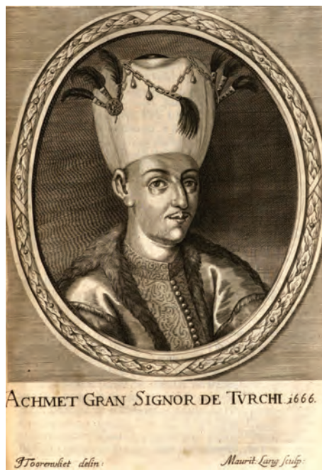
Fig. 4. Portrait of the Grand Vizir Fazıl Ahmed pasha in Priorato's book entitled Historia di Leopoldo Cesare (1670)

knowing the army's firepower capacity was a decisive factor in early modern warfare.