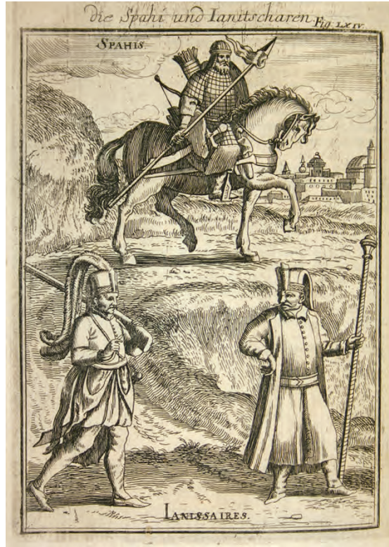
Fig. 5. Sipahis and janissaries. Engraving of Alain Manesson Mallet (1683)

According to the imperial budget of 1661, 15.248 cavalry soldiers in the so-called six regiments of the kapıkulu corps received pay from the Ottoman treasury 32 . However, it is not certain to what degree these cavalry units were mobilized in the Ottoman-Habsburg war of the ensuing years. The aforementioned anonymous eyewitness claims to have seen 12.000 sipahis around the fortress of Érsekújvár in the autumn of 1663 33 . Ottoman sources, on the other hand, remain interestingly silent on the matter. The only clear reference discovered thus far is a financial entry computing the salary of a