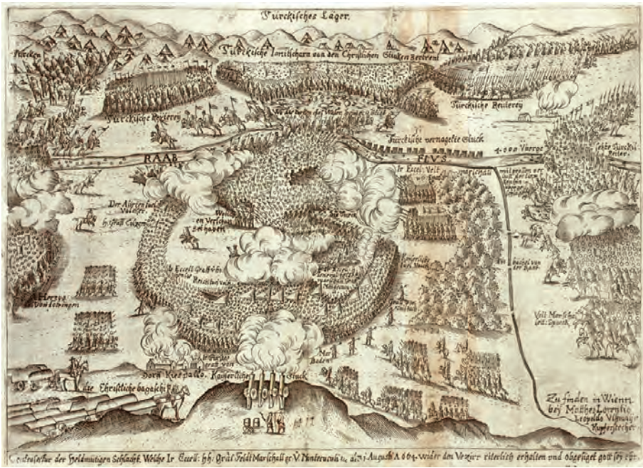
Fig. 1. The battle of St. Gotthard, 1 st August 1664. Engraving of M. L. L. Ultzmayer

this reason, one must be prepared to delve into the complexities of official documents and give meaning to figures randomly appearing in contemporary accounts. This alone, however, does not overcome the complication. The archival sources on the Ottoman field army of 1663-64 are, so to speak, very unwilling to cover all the military units of the Ottoman army at a given time offering instead glimpses of randomly exposed units on different occasions. Taking such hardships into account, a descriptive picture of the Ottoman fighting forces can surface by critically juxtaposing and aligning all relevant and surviving material.