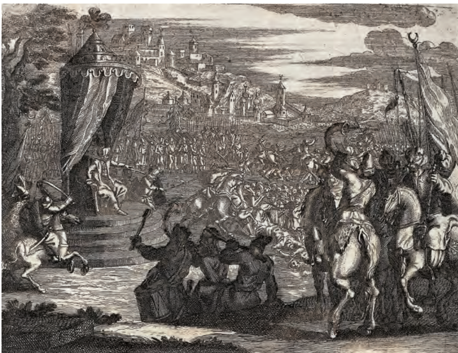
Fig. 3. Turkish camp during the campaign of 1663 in Hungary. Engraving from Paul Rycaut's work on the Ottoman Empire (1694)

contribution, certain names brought forward by contemporary accounts will prove useful.