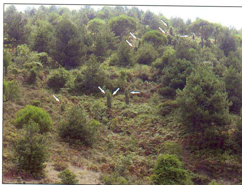
Fig. 3. J. oxycedrus f. yaltirikiana in loco classico between Göbü and Türkali villages, E of Zonguldak, NW Turkey –juniper specimens are marked by arrows.